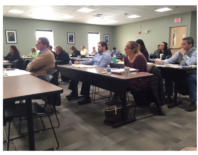
PODV First Class

To participate in the program, a volunteer attorney agrees to undergo twelve hours of Continuing Legal Education training and to take one or two PODV cases which are accepted via the Volunteer Lawyer Program. The PODV's first class consisted of seventeen volunteer attorneys and seven mentors. The first all day training program was offered at the Rhode Island Bar Association in February 2016. The seventeen volunteer attorneys were presented with a comprehensive program that included a presentation about domestic violence by the Executive Director of the RICADV and several private and RILS' attorneys. The final training was held on a Saturday in a courtroom of the