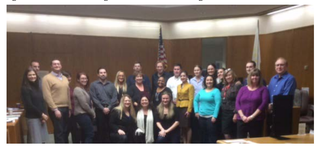
Volunteer Mentors from the first PODV class

an experienced family law attorney, who will closely mentor a pair of volunteer attorneys, as they provide individual representation to the client. Each client will also be referred to a domestic violence advocate who will be available to provide critical support services and safety planning.